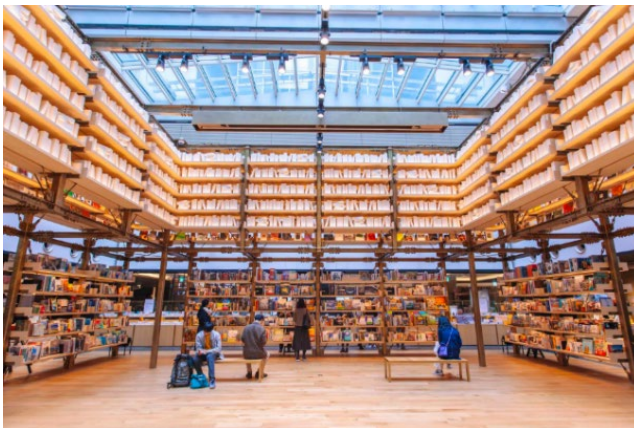
Sybilla Patrizia, Ginza Six

Welcome to Ginza Six . An exceptional combination of high-end shopping, local Japanese culture, and global contemporary art. Behind the walls imagined by visionary architect Yoshio Taniguchi, lies a destination designed for a completely different experience. Common areas designed by