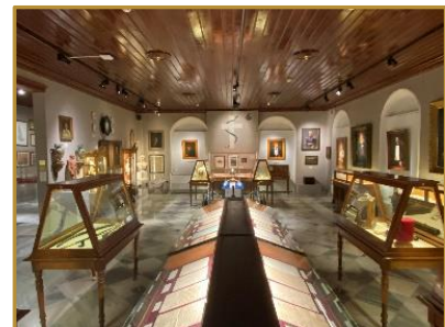
Historical Archives – Museum of Hydra

Placing historical memory on display is the most effective means of communicating with visitors. The goal of HAMH is to locate, gather, classify, index and publish every kind of archive material related to Hydra, its local history, tradition and culture. The Museum, founded in 1918, displays among others the cultural treasures related to the Greek War of Independence started in 1821, for which both Greek and Hydriot victory is still object of wide celebrations such as the Miaoulia .