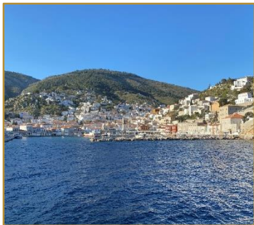
Hydra, view of the port

A main place happens to be the common ground of our artists: Hydra . This Greek Island, having being forever the refuge for the artists in search of inspiration, hosted the creative workshop which gave birth to the exhibition. Neverland , Le pays imaginaire , L'isola che non c'è : many names to describe this almost sacred destination, cradle of the Western culture.